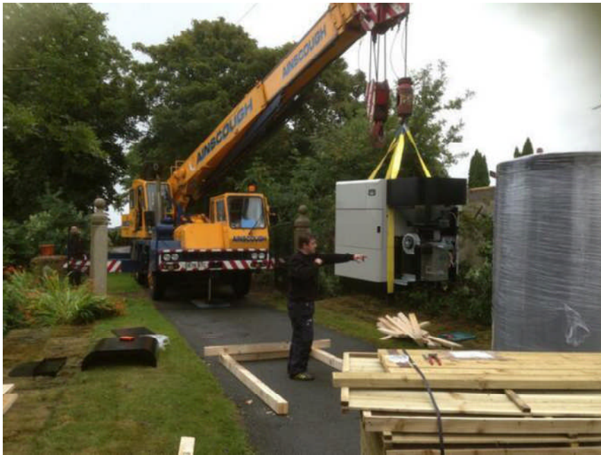
Ainscough Crane Hire lifting 199kW E-COMPACT in through roof of Plant Room