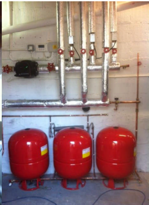
Auger Fed to 199kW E-COMPACT Pellet Boiler: Old Building converted to a Plant Room